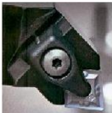
TURNING TOOL HOLDER