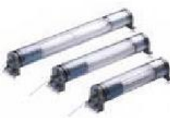
CNC MACHINE LAMPS - WHITE LIGHT - WATER PROOF