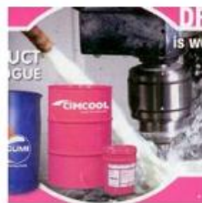
WATER SOLUBLE COOLANT OILS