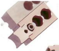
QUICK CHANGE SOFT JAW TIPS FOR POWER CHUCK