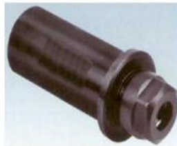
ER COLLET CHUCKS FOR TURRET % ER COLLETS