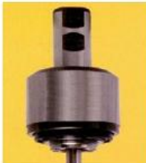
FLOATING REAMER HOLDER & TAPPING ATTACHMENTS