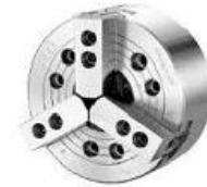
HYDRAULIC POWER CHUCKS