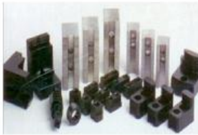
SOFT JAWS AND T-NUTS FOR HYDRAULIC POWER CHUCK