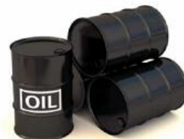
HYDRAULIC, NEAT OILS & RUST PREVENTIVES