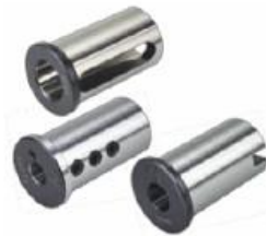
TURRET SLEEVES FOR BORING BAR-CYLINDRICAL SHANK AND DRILLS TAPER SHANK